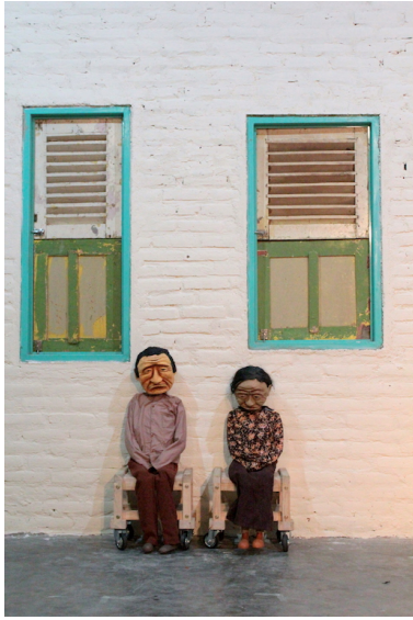
Papermoon Puppet Theatre, Suara Muara (The Sounds of the Estuary) , 2016.