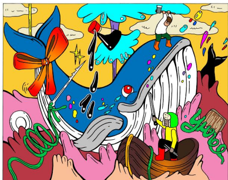
Yuree Kensaku, Don't They Know It's the End of the Whale? From the series 'Apex Predator', 2016.