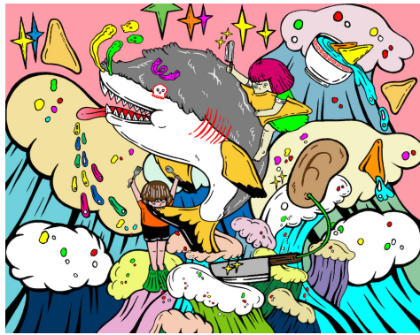
Yuree Kensaku, The Finale Fin of Shark's Fins . From the series 'Apex Predator', 2016. Image courtesy of the artist and 100 Tonson Gallery.