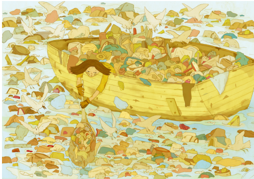
Tan Zi Xi, An Effort Most Futile , 2008.