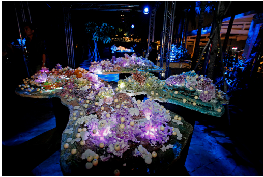
Janice Wong, Underwater Labyrinth , 2011.